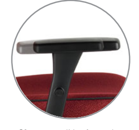
GI armcap slides forward or backward to position for body size.